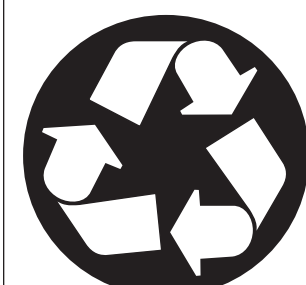
The Williamsport Sun-Gazette is printed on newsprint which contains recycled material

Levels can also be used to adjust the color of an image, which I will address in my next column.